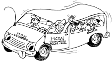
The Booze Cruiser